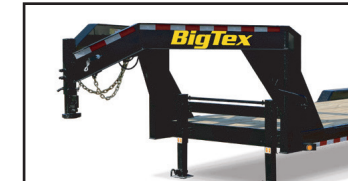
Also Available with Gooseneck on 20', 22', & 24' Lengths"